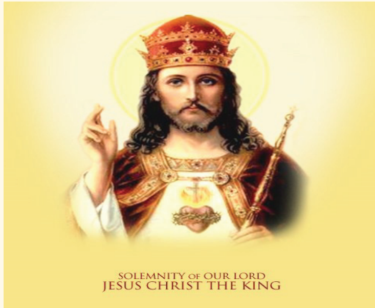
SOLEMNITY OF OUR LORD JESUS CHRIST THE KING